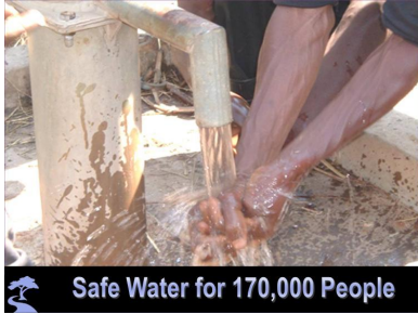
Safe Water for 170,000 People