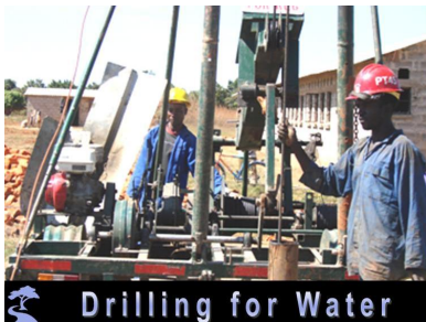
Drilling for Water